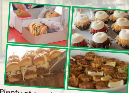
Plenty of good eats during and after the tournament round.