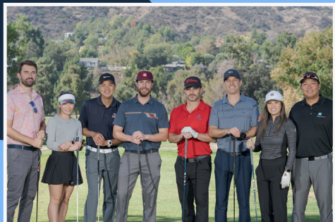
A look at a few of our groups before hitting the first tee box.