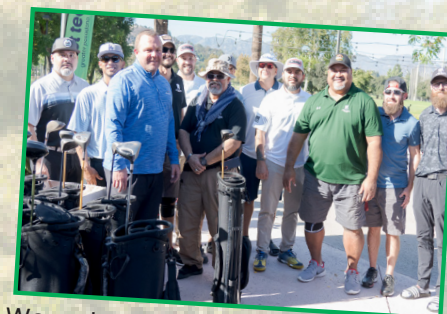
Wounded Warrior Project members honored with golf equipment